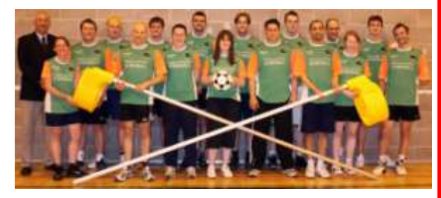
The adult section at our previous club!

In the summer, many clubs hold outdoor tournaments. This enables players to compete against teams from all over the country during the course of a day, and is normally followed by an evening social event.